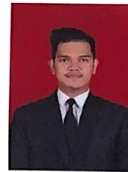
No. Series : B-60776